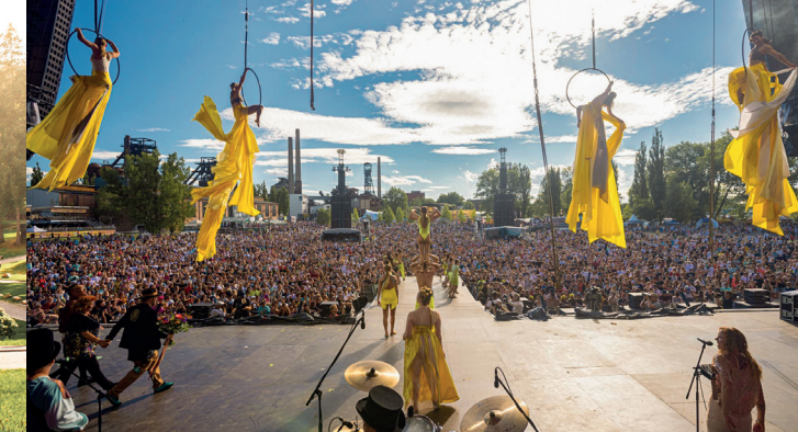
Colours of Ostrava