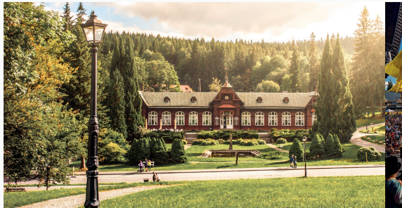
Karlova Studánka Spa

Our region hosts the largest events in the Czech Republic. Music festivals, conferences, or sports events of international character.